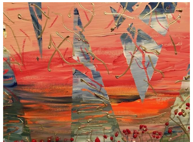
Sheila Martin: 'Kaleidoscope', mixed media