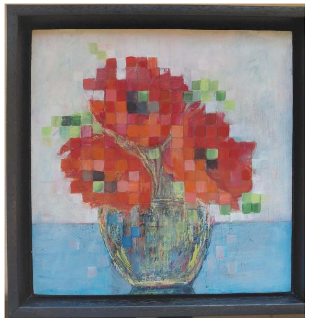
Elaine Baker: 'Through a Different Lens', acrylic