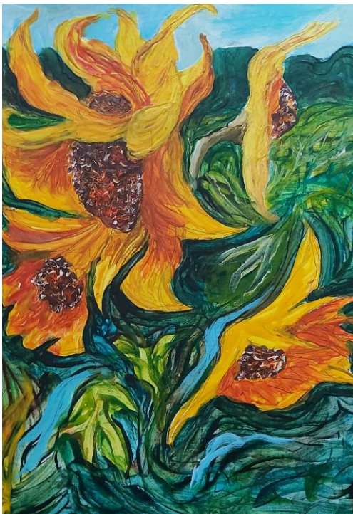
Dorothy Worrall: 'My Sunflowers', acrylic