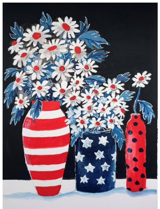
Stella Mance: '4 th of July', acrylic