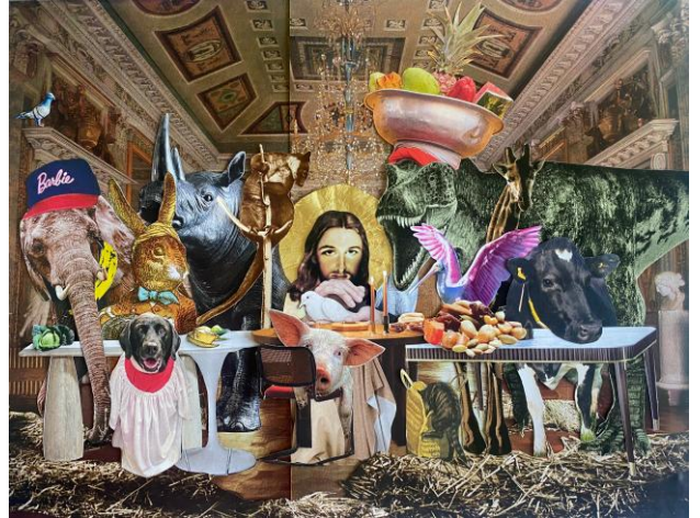
Melissa Hall: 'The Last Supper 3.0', analogue collage