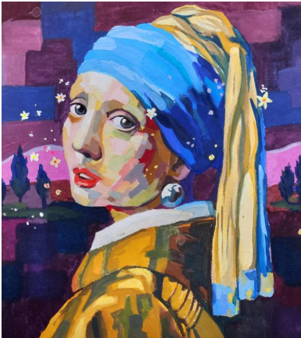
Bridget Vaughan: 'After Vermeer', gouache