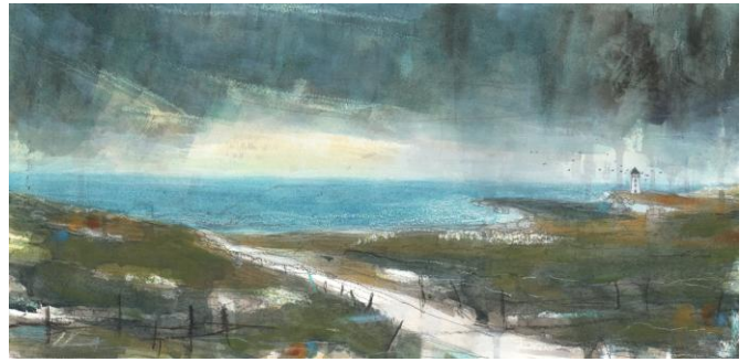
Lisa Kossuth: 'The Chalk Path', mixed media